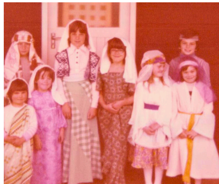
CHILDREN'S CHRISTMAS PLAY 1980'S