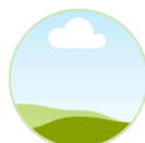
Rachel Children's Ministry