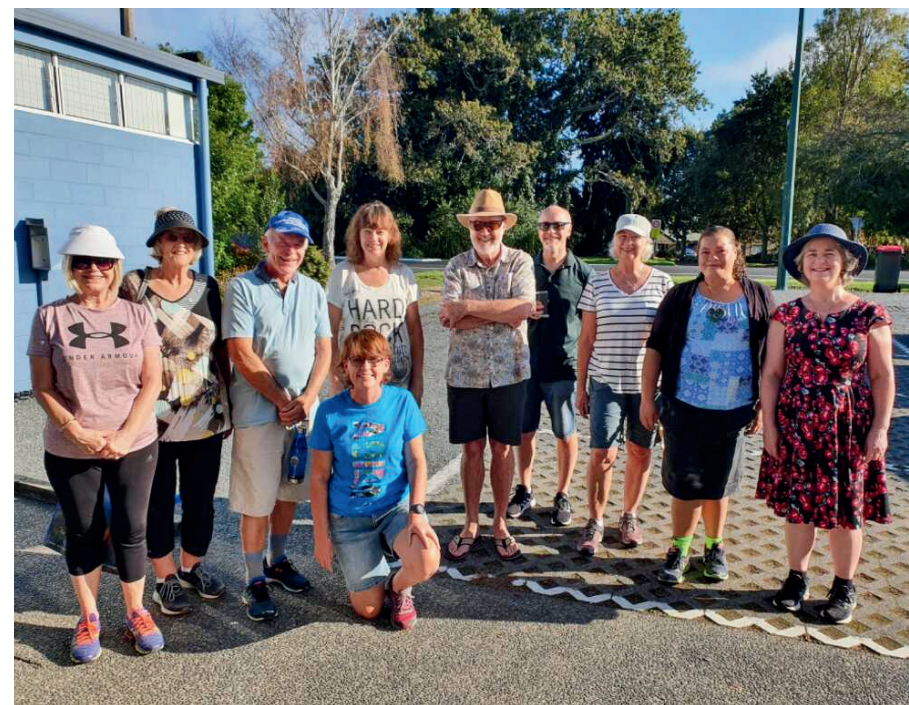
THE HOPE PROJECT DELIVERY VOLUNTEERS 2022