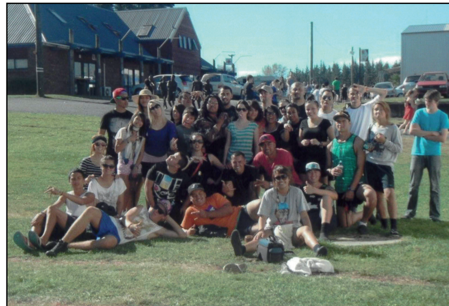
RBC YOUTH GROUP 2012