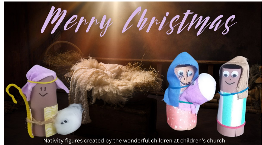
Nativity figures created by the wonderful children at children's church

Postal Address: P.O. Box 70040, Ranui, Auckland 0655