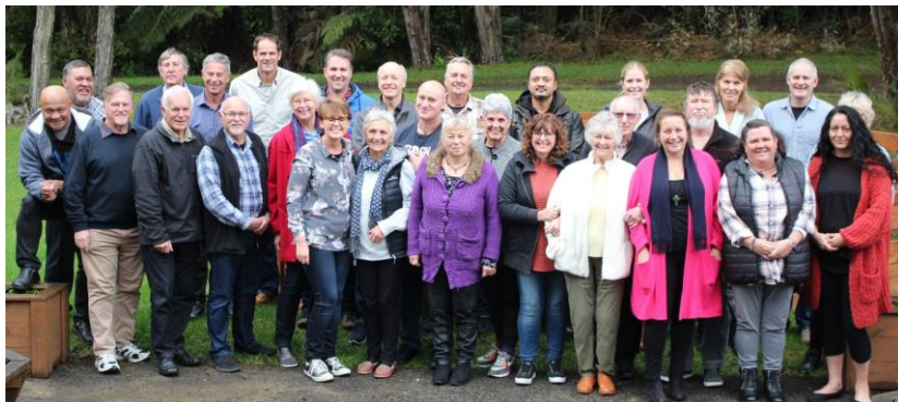
Planning Day 2019