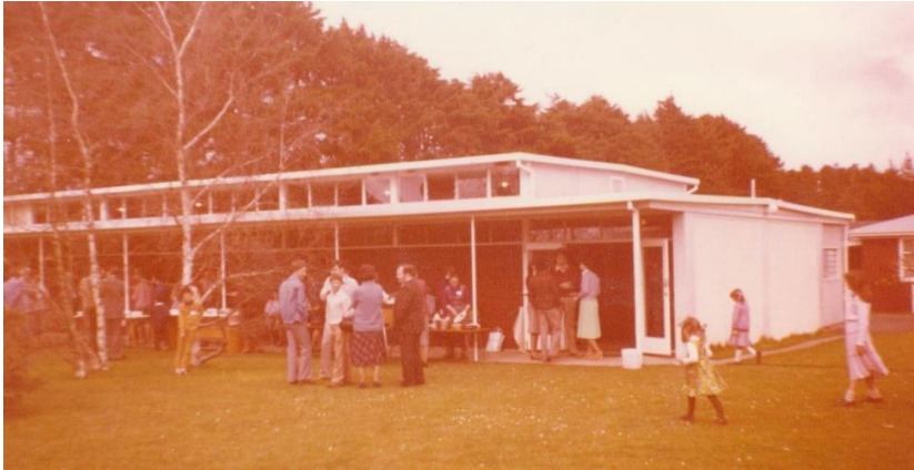
15 th Anniversary